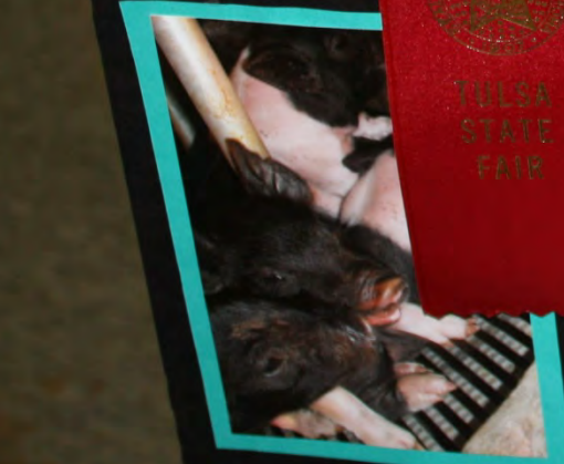
Play with me!