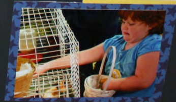
Photo Caption: Gingerbread Daycare children especially enjoyed holding the small animals like the chicks and chicks. Bakers are instructed to hold the smaller animals in white padding.