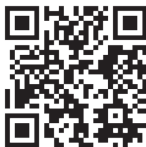
Event Planning Tips