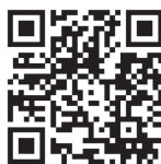
Leadership and Life Lessons