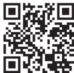
CTSO Chapter Management